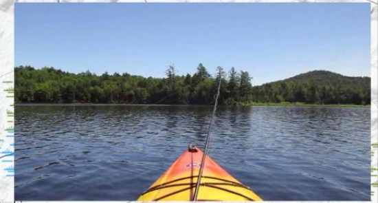
Pigeon Lake Wilderness